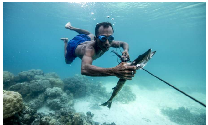
In addition to the nets and lines traditionally used for fishing, the Bajau use a handmade “pana” for spearing their catch.

The future of the Bajau remains uncertain. Cultural dissipation looks likely to continue, as they contend with a modern world of nation states that has little room for wanderers. Still, conservation charities like WWF and Conservation International are helping create marine management programmes that encourage sustainability through no-fish zones and a return to artisanal fishing methods. It is often Bajau that socialise such programmes to local communities, communicating key messages at a grassroots level. There are also efforts underway to increase the benefits from burgeoning tourism, particularly in Semporna. If nothing else, such grassroots programmes demonstrate that the Bajau’s reverence and knowledge of their marine environment could so easily be used to conserve rather than destroy.